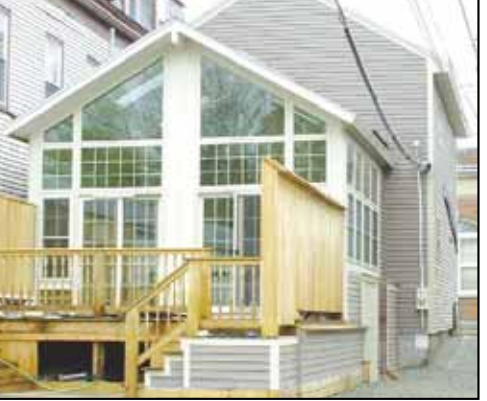
Call American Dreamspace at 676-2800 to make an appointment for a consultation or to schedule a time to visit the new showroom in downtown North Berwick. (File photos)

American Dreamspace in North Berwick has a new showroom where potential clients can view a variety of sunrooms. Once clients chose a room, American Dreamspace handles design and permitting for the structure at no extra charge. (File photo)